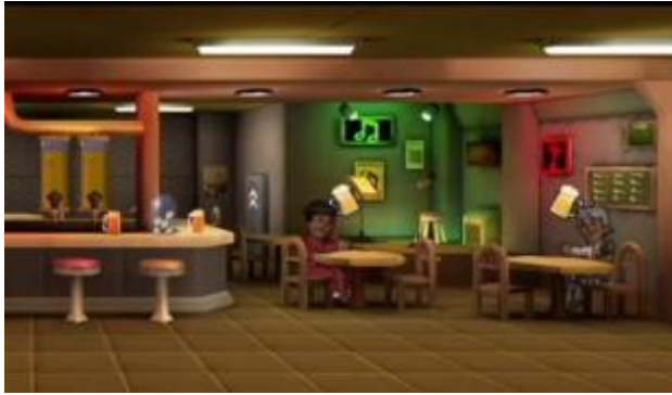
FALLOUT SHELTER: Patrons drinking