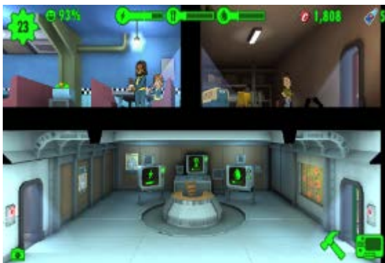
FALLOUT SHELTER: Room close-up