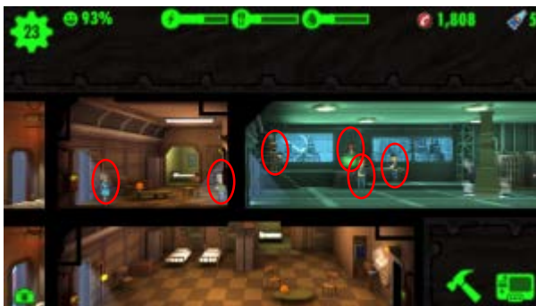
FALLOUT SHELTER: Character locations