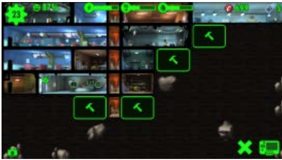
FALLOUT SHELTER: Room placement