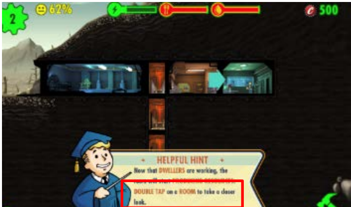
FALLOUT SHELTER: Zoom tutorial