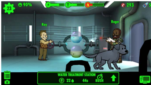
FALLOUT SHELTER: Character shading