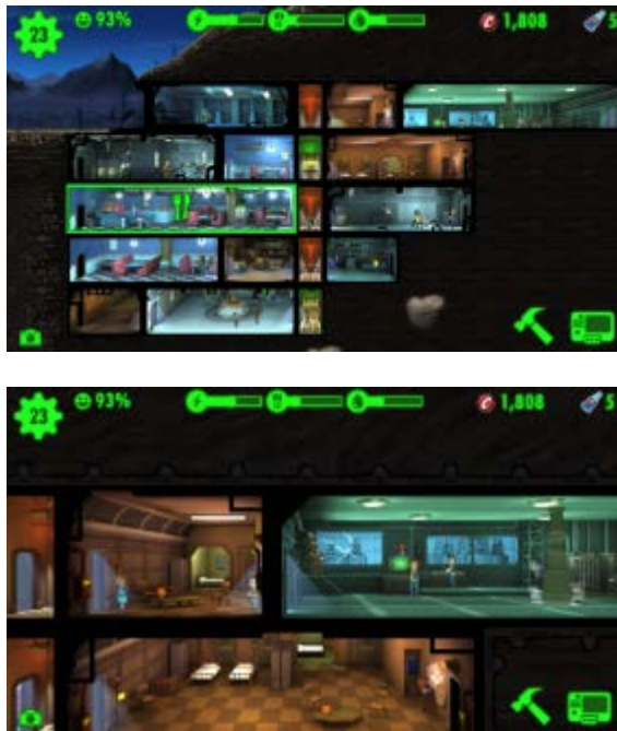
FALLOUT SHELTER: Gameplay Layout