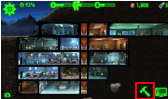
FALLOUT SHELTER: Build icon